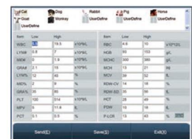
Normal Value Setting

Rayto Rayto Life and Analytical Sciences Co.,Ltd.